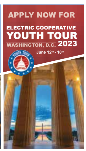
Learn more at www.smpa.com/youth-tour-and-youth-camp Application Deadline: January 16th, 2023