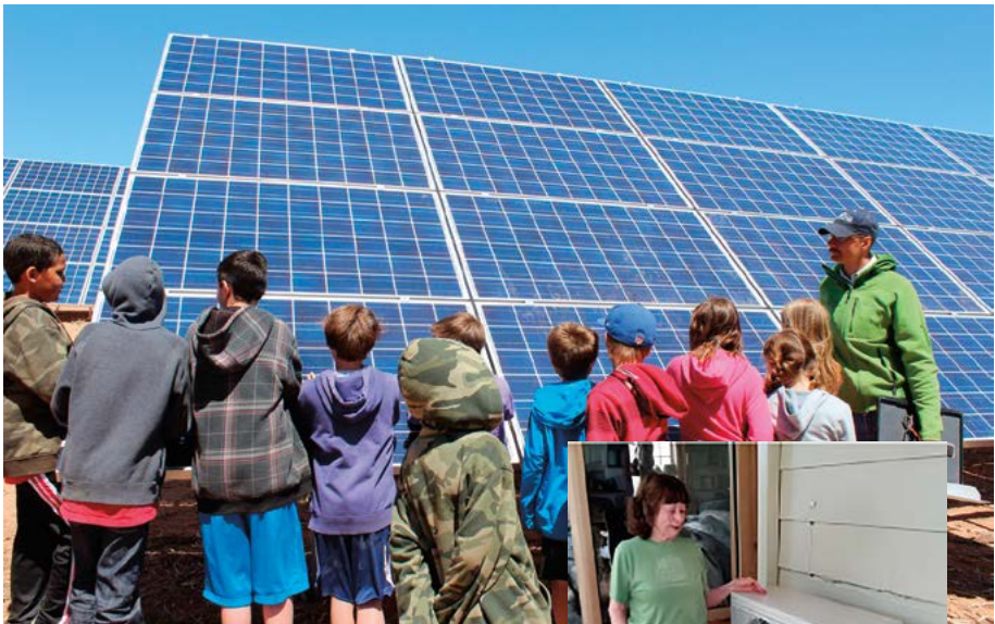
Above: The one-megawatt solar array in Paradox is one of SMPA's local renewable projects enabled by the Green Fund.

By participating, members power their homes with renewable energy while investing in a sustainable future. SMPA thanks you for supporting a greener, stronger community.