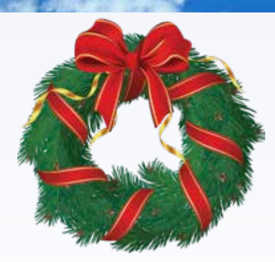
Offices Closed December 25th

Basic services are always available in https://smpa.smarthub.coop/Login.html