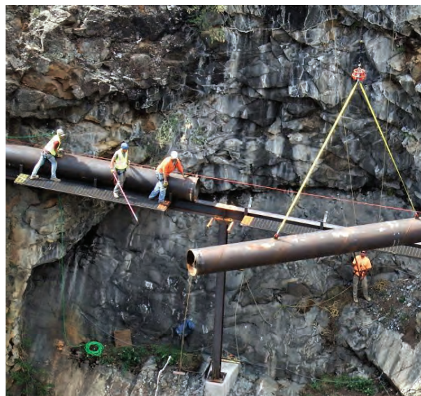
A new penstock is put in place to replace the one taken down by rockfall.

This winter, as climbers are making their assents and warming up with electricity provided, in part, by the Hydro plant, they should know that their host community beat incredible odds to make it happen. Nicely done.